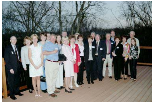
Volunteer & Board Group Photo